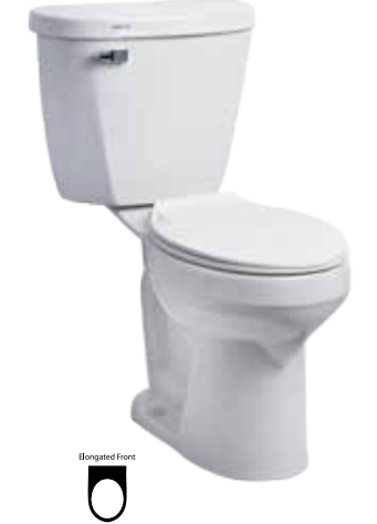
Model 388-387 Toilet seat not included